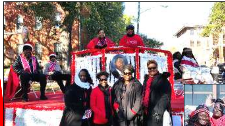
CELEBRATING THE LIFE AND LEGACY OF MARTIN LUTHER KING, JR.