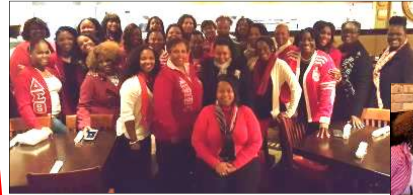
Pictured left and below: Sorors at dinner at Carrabba's Italian Restaurant